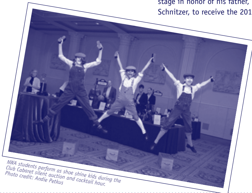
NWA students perform as shoe shine kids during the Club Cabaret silent auction and cocktail hour.